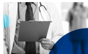
English for Doctors