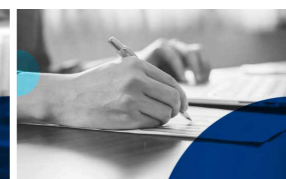
Reach IELTS Writing