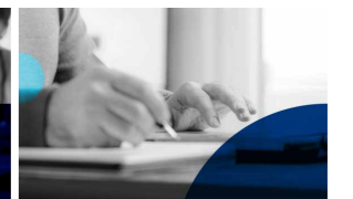
OET Writing Correction