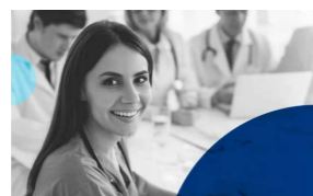
English for Medical Academic Purposes