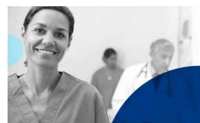
English for Care