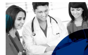
OET Placement Test