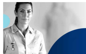
English for Nurses