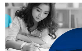
IELTS Practice Tests