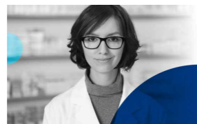
English for Pharmacy