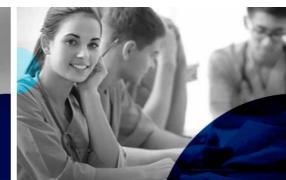
Reach OET B Nursing