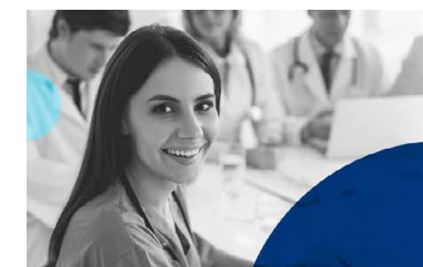
English for Medical Academic Purposes