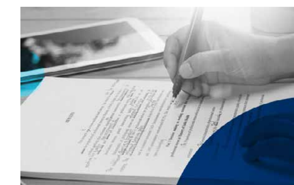
Essential Grammar for Healthcare