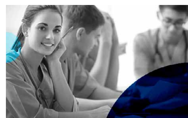
Reach OET B Nursing