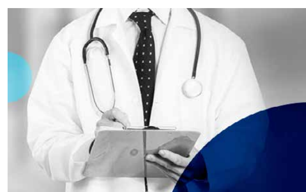
Reach OET B Medicine