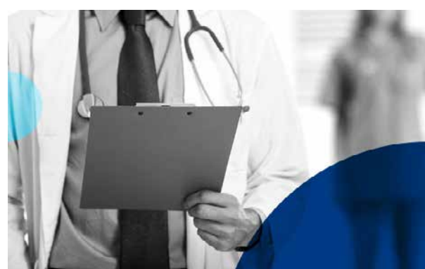
English for Doctors