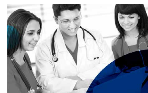
OET Practice Tests