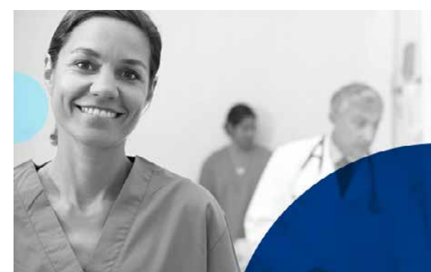
English for Pharmacy