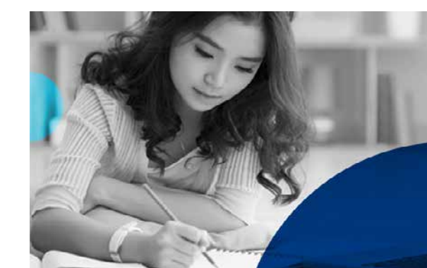
IELTS Practice Tests