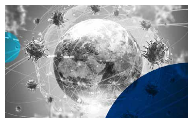
English for Pandemics