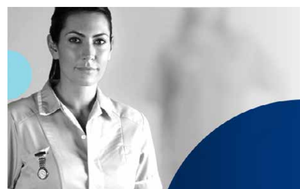
English for Care