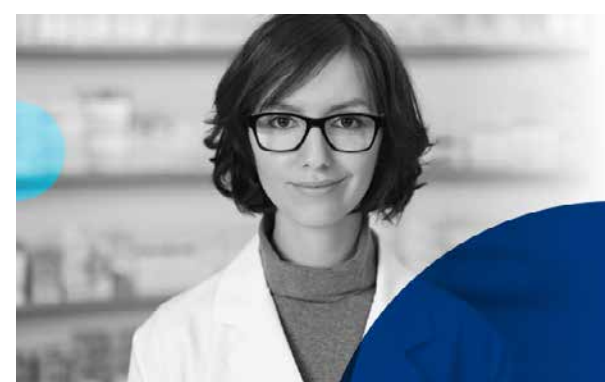
English for Nurses