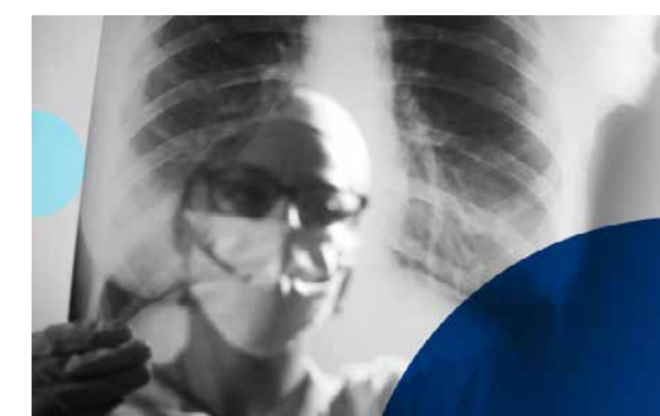
English for Radiology